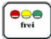
Additional sign to 270.1